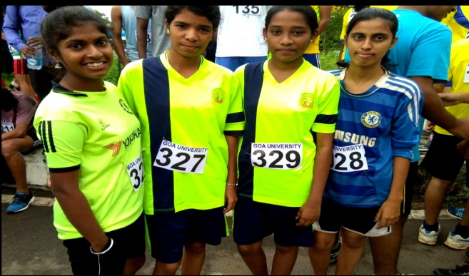
GMFC cross country boys team finished overall 6th place and girls tem finished overall 5th place at the cross country race organised by goa university.