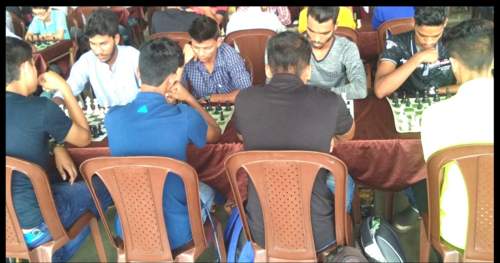
The inter college chess was organised by the Goa University on 31 st July and 1 st August 2018 at the Jubilee hall, Goa University. The Goa Multi Faculty team finished 20th out of 41 colleges participating.