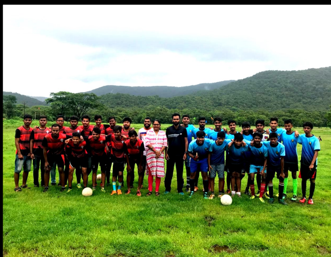
Inter collegiate football tournament at was organised at Sanjeevani Sugar Factory ground on 13th August 2018.