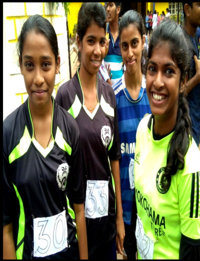
Students participated in inter-collegiate cross country tournament organised by FR Agnel college pilar on 28th July. The girls team secured overall 6th place and the boys team secured 4th place .