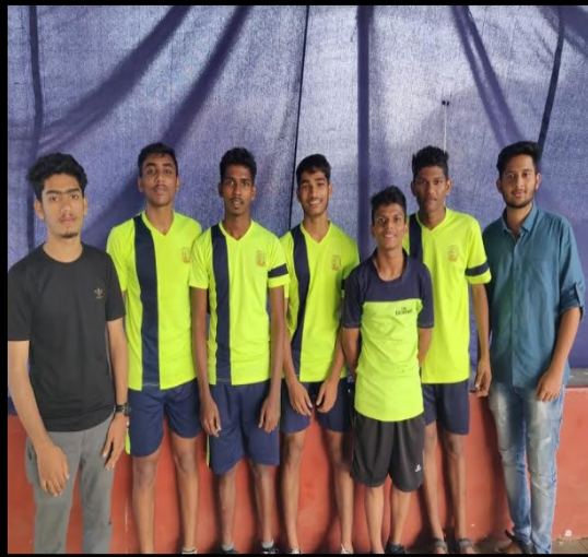
The college boys team reached semi finals in inter college Tennikoit championship held from 21 st to 24 th August 2018.